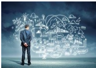
Project Testing, & Implementation