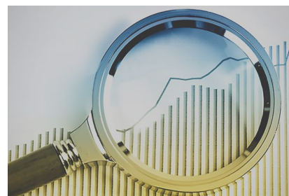
Sustainability & Profitability