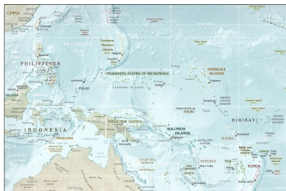
Oceania & Tropics