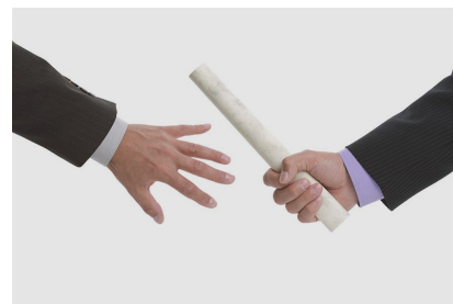
Succession & Exit